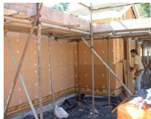
Application of Diffutherm Boards

Commentary: For the performance of the building this seems to have been a cost effective build. Speed and dryness of build help the fit out. Further assessment of cost will be undertaken in more detail as information is made available by the contractors.